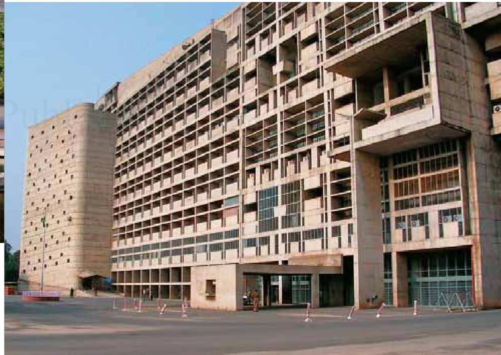
| I.5 The facade of the Secretariat building (1951–58) by Le Corbusier has a brilliant rhythmic variation in the placement of the vertical supports as well as the location of horizontal sun-breakers and the parapets.